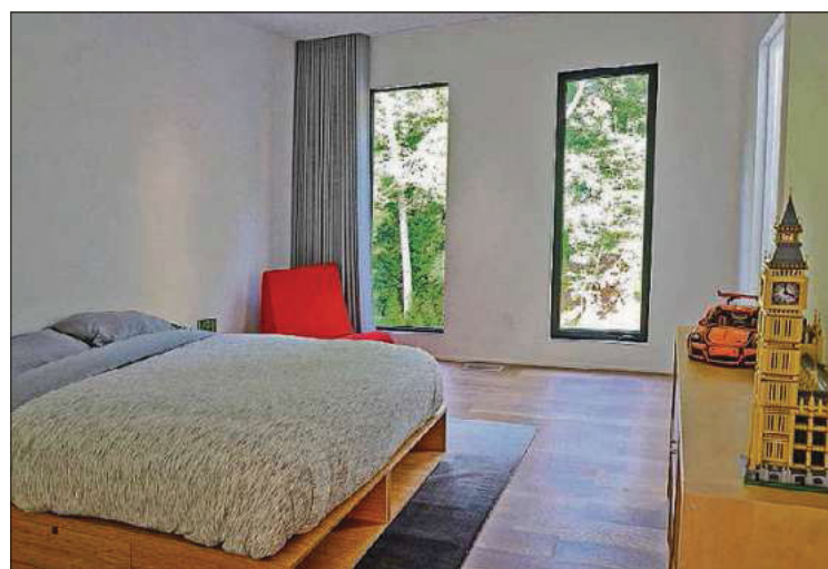
A bamboo Buden bed by Stem with gray bedding is joined by a red chair from Vitra in one of the children's bedrooms. The dresser displays Lego sets, including Big Ben and a Lego Technic Porsche.