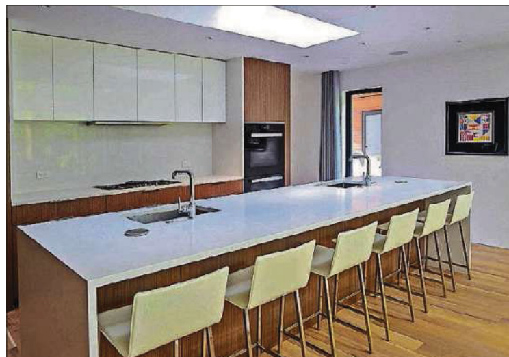
The minimalist kitchen features an island of Caesarstone quartz countertops and a half-dozen stools from CB2. The oven is by Miele. The backsplash tile is from Porcelanosa.